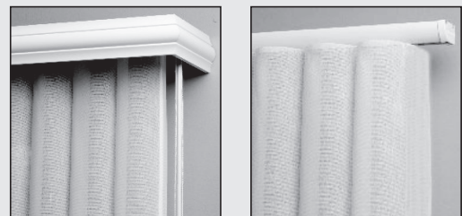
Figure 3: With and without the optional valance.